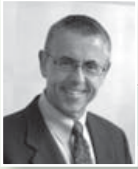
Dr Norman Swan A matter of health

In this issue we cover some recent research into exercise. The benefits of exercise have been underestimated for many years, but the evidence is now strong in several areas. Let's take being overweight or obese. It's been shown that being fit can get rid of the serious risks from being fat, even if you stay fat. No-one's suggesting that's a reason for not losing weight because being obese can cause all sorts of other problems such as arthritis of the knees. But the fact is that if